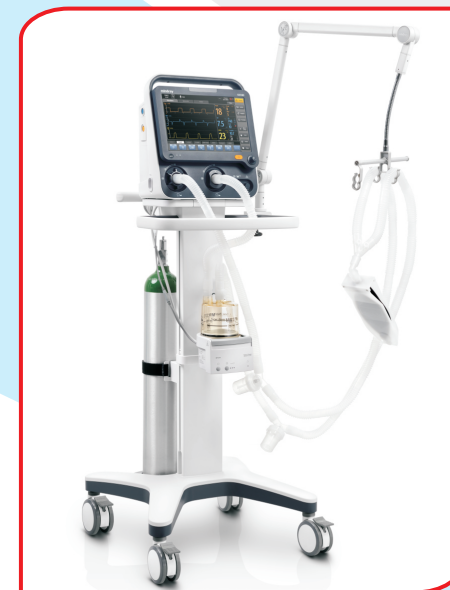
VENTILATOR - SV-300