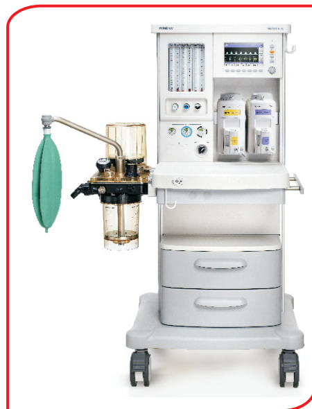
ANESTHESIA - WATO - 20