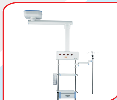
PENDENT - HYPRT