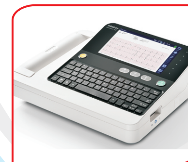
ECG - R12