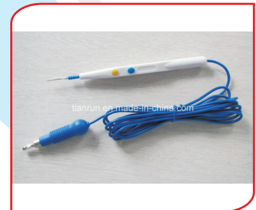
ELECTROAL - PENCIL