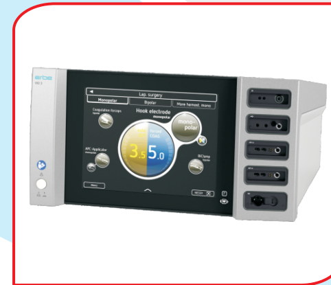
ELECTRO SURGICAL UNIT VIO 3