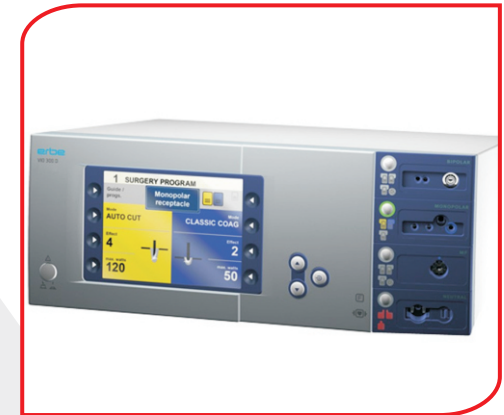
VIO 300 D