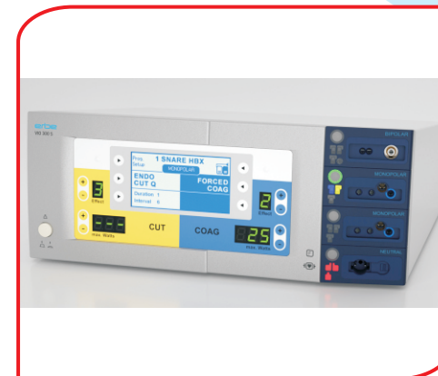
VIO 300 S