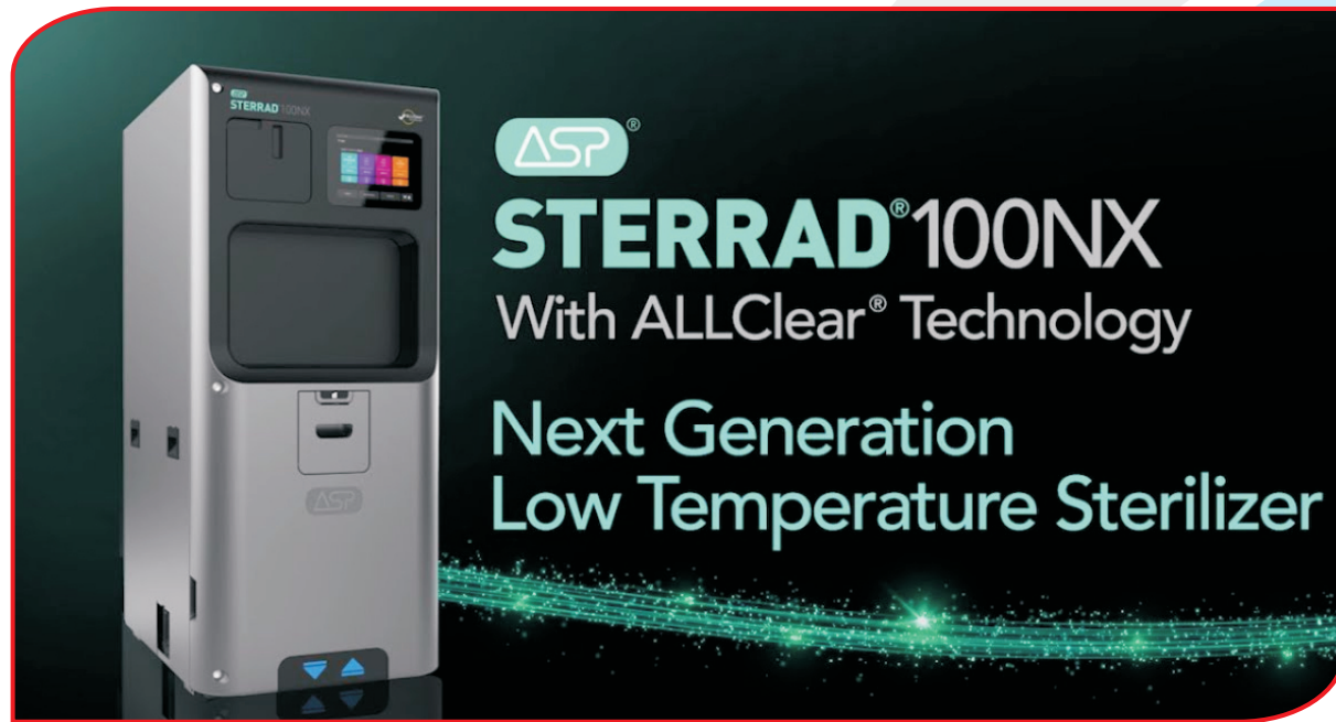
STERRAD PLASMA STERILIZER