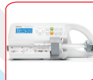
SYRINGE PUMP - Sp1