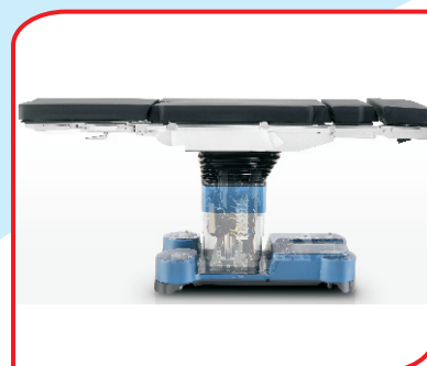
OT TABLE - UNIBASE - 30