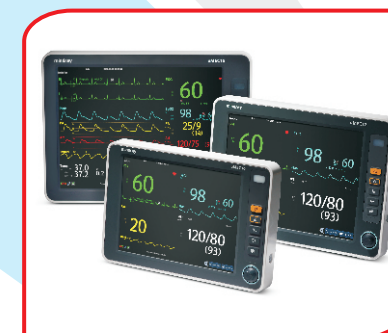
MONITOR - UMEC