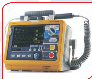
DEFIBRILLATOR - D2