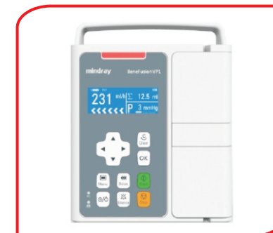
INFUSION PUMP - Vp1