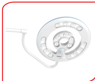
OT LIGHT - 6 SERIES